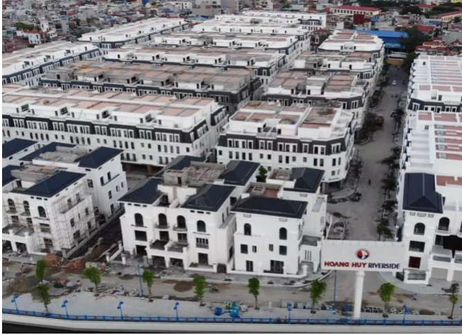
Hoang Huy Riverside Project

In October, the company continues to hand over more houses of of Hoang Huy Riverside Project and the first apartments of Gold Tower Project to clients.