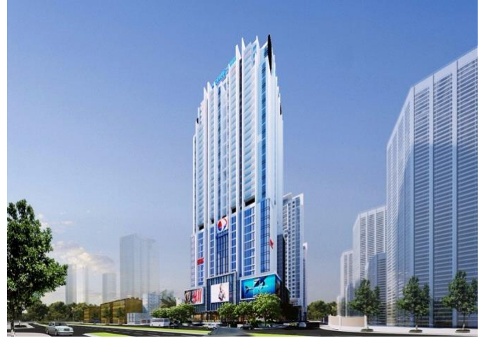
Gold Tower Project

In addition, at the end of October, TCH's BOD approved the resolution to invest in a new project - Hoang Huy Plaza (at 199 To Hieu Street, Le Chan District, Hai Phong City) with the estimated investment of VND 834 billion. It is expected that the necessary procedures will be completed in 2019.